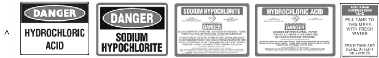
HAZARDOUS SIGNAGE *AVAILABLE AT WTI, TEL:(714)564-9100

PROPRIETARY AND CONFIDENTIAL THE INFORMATION CONTAINED IN THIS DRAWING IS THE SOLE PROPERTY OF WATERLINE TECHNOLOGIES. ANY REPRODUCTION IN PART OR AS A WHOLE WITHOUT THE WRITTEN PERMISSION OF WATERLINE TECHNOLOGIES IS PROHIBITED.