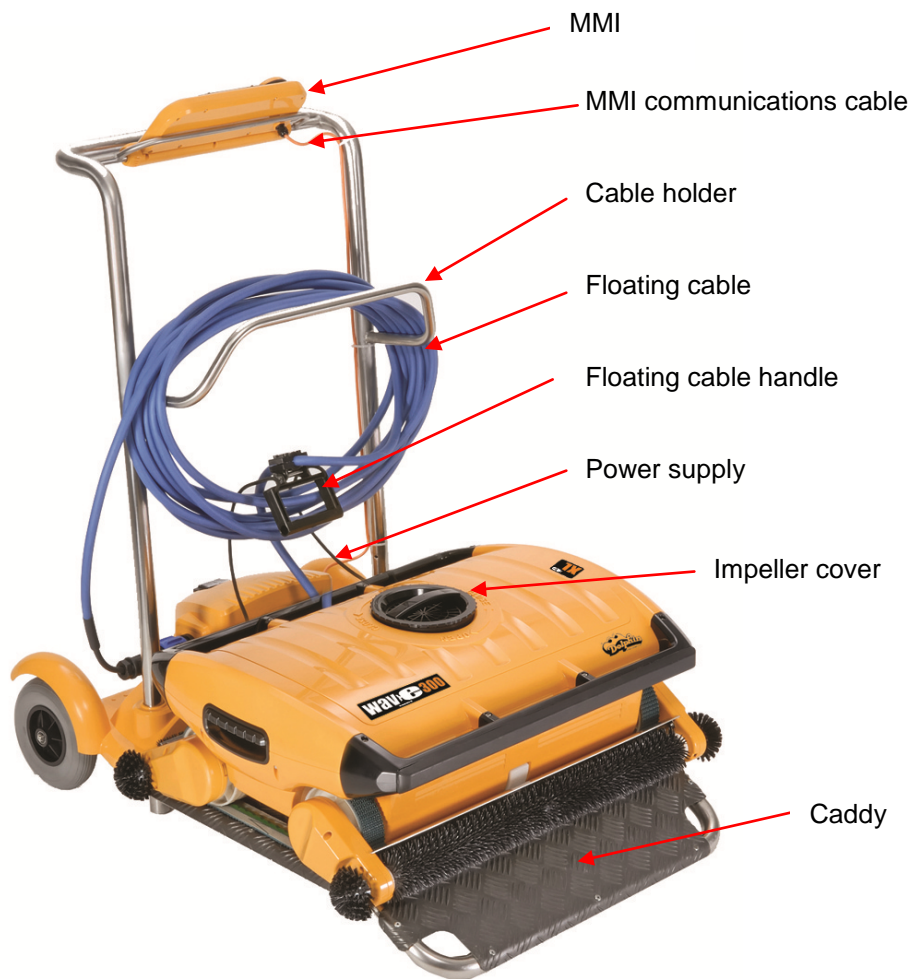
MMI communications cable